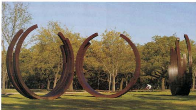
The Bernar Venet exhibition at Hermann Park in Houston, Texas, includes "Arcs in Disorder: 3 Arcs x 5."